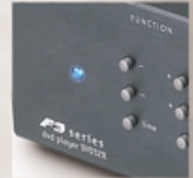
Pure blue power light and tactile switches

Pantera-DVD is a trademark of Mediamatics.