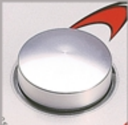
Hollow, polished lightweight metal puck for low inertia