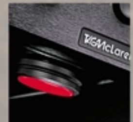
Custom-made isolation feet for vibration de-coupling