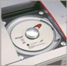
Heavy sub-chassis for jitter reduction at source