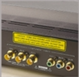
BNC and RCA for best component video