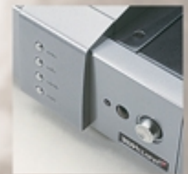
Solid 8 mm aluminium front, rigidly fixed to a 3 mm top plate